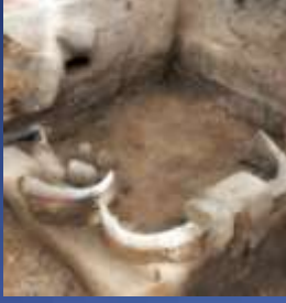
Neolithic Site of Catalhoyuk, Konya