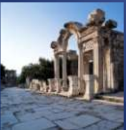
Ephesus, Selçuk, Izmir