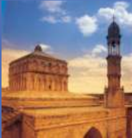
Cultural Landscape, Mardin