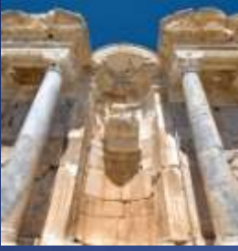
Archaeological Site of Sagalassos, Burdur