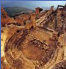
Alahan Monastery, Mersin