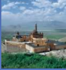
Ishak Pasha Palace, Agri