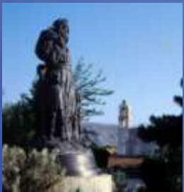
St. Nicolas Church, Demre, Antalya