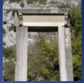
Gulluk Mountain Termessos National Park, Antalya