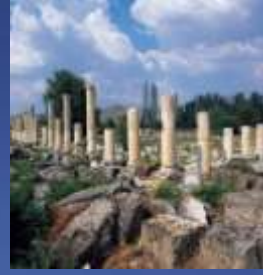
Archaeological Site of Aphrodisias, Aydin