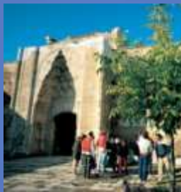
Seljuk Caravanserais on the route from Denizli to Dogubeyazit