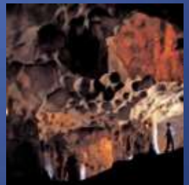
Karain Cave, Antalya