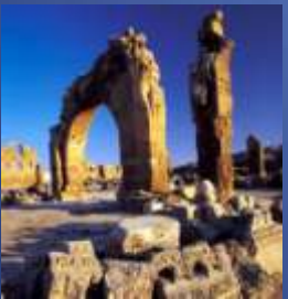
Harran -Ş.urf settlements, Şanlıurfa