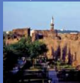
The Citadel and the Walls, Diyarbakir