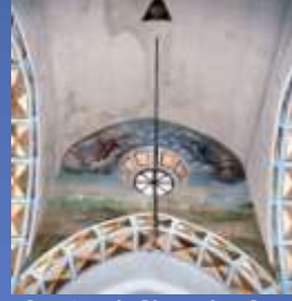
St. Paul Church, St. Paul's Well, surrounding historic quarters, Tarsus