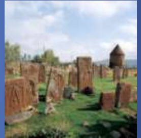
The Tombstones of Ahlat, Urartian and Ottoman Citadel, Bitlis