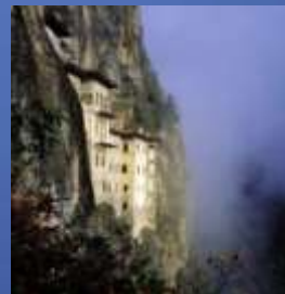
Sümela Monastery, Trabzon