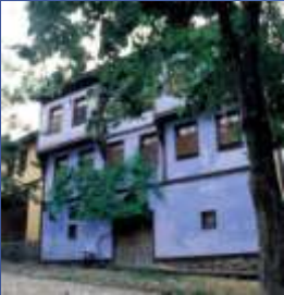
Early Ottoman Urban and Rural Settlements, Bursa