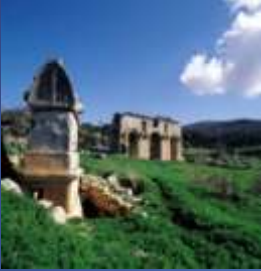
Ancient Cities of Lycian Civilization, Antalya