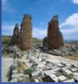
Archaeological Site of Perge, Antalya